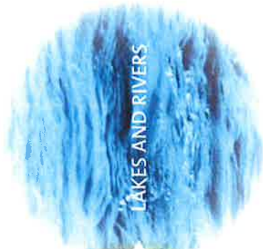
LAKES AND RIVERS