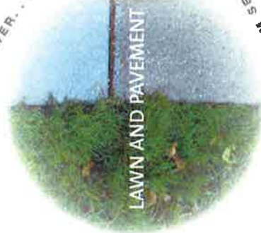
LAWN AND PAVEMENT